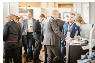
Pictures from Vaasa Gas Exchange 2019 event